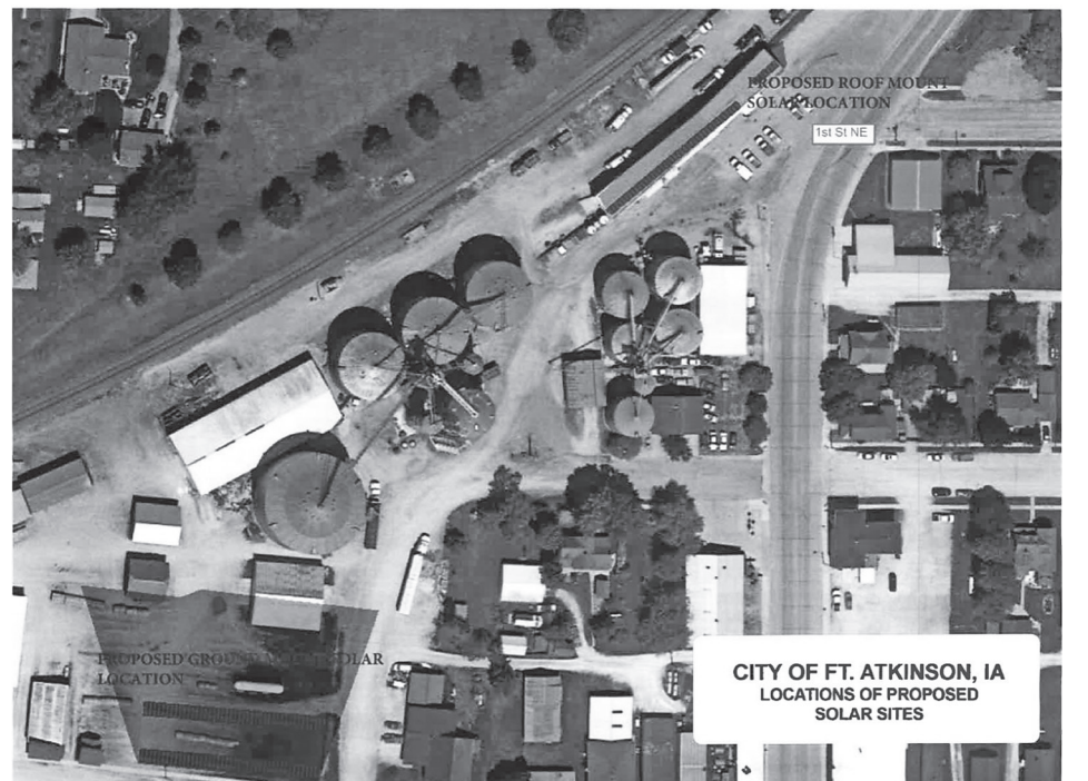
Published in the Calmar Courier on February 13 and February 20, 2024.

The environmental documentation regarding this proposal is available for review at 1510 3rd Street SW, Waverly, IA 50677. For questions regarding this proposal, contact; Travis Peters, Area Specialist at 319-483-0096. Any person interested in commenting on this proposal should submit comments to 1510 3rd Street SW, Waverly, IA 50677 by February 27, 2024.